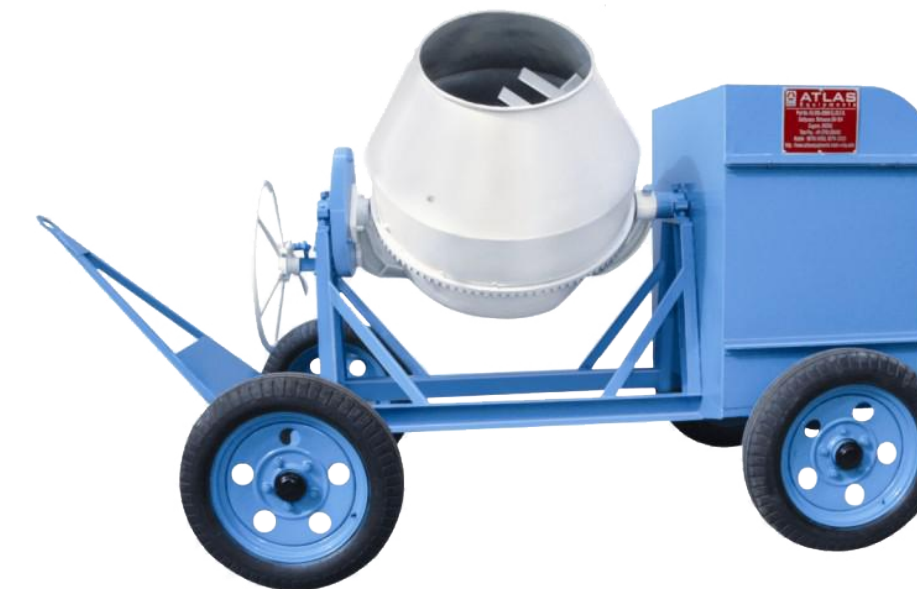
CONCRETE MIXER WITHOUT HOPPER