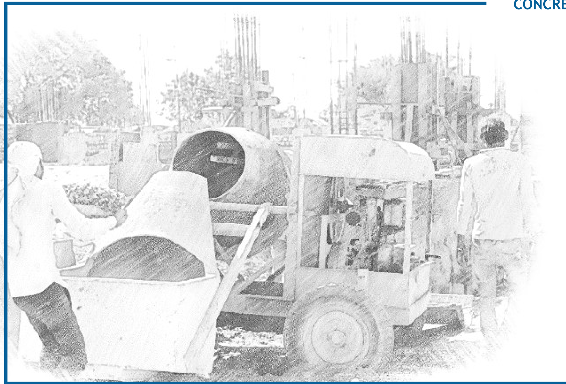
CONCRETE MIXER WITH HYDRAULIC HOPPER