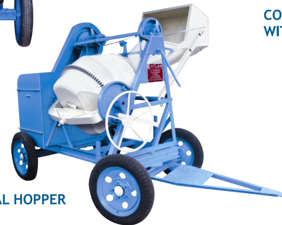
CONCRETE MIXER WITH MECHANICAL HOPPER